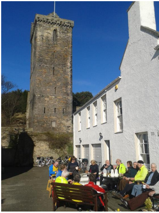
2 nd March, Pan Ha' meet 'alfresco'