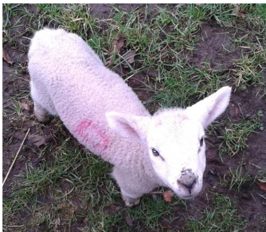
16 th Feb. first lambs on return from Denbrae meet