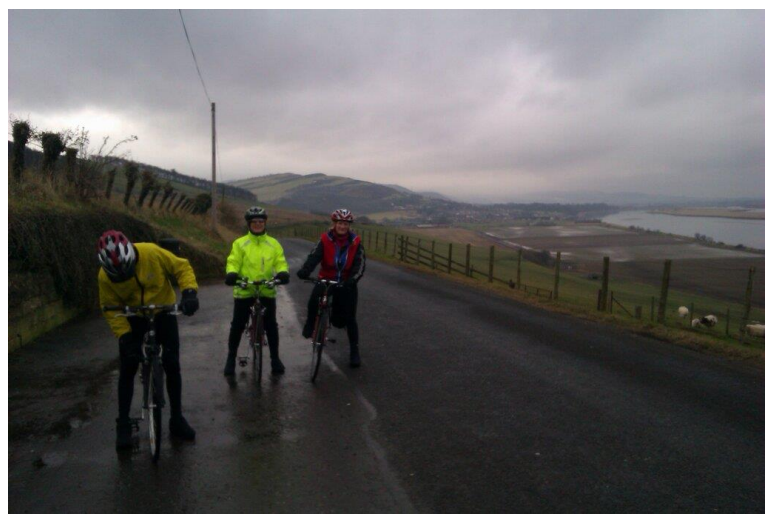
16 th Feb. en route to Morwyns, Denbrae