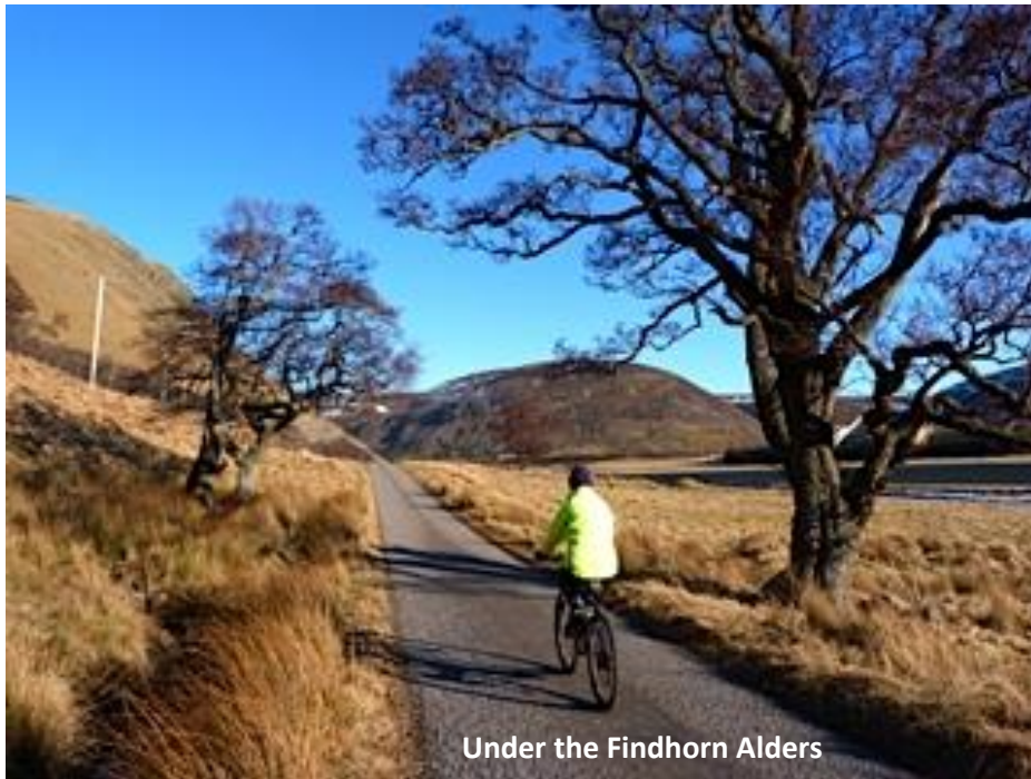
Under the Findhorn Alders

After some R&R and B&B in Inverness we took a monstrous route, but no Nessie and even the landlady wasn't bad, to Strathconon. We left the car above Loch Achonachie and set off hoping for the bright sunshine to return. It never quite did but the wind had dropped and it was still cold enough to freeze the waterfalls, not a euphemistic reference to bladder relief stops! The glen was spectacular nevertheless with more forest than we expected and certainly more inhabitants.