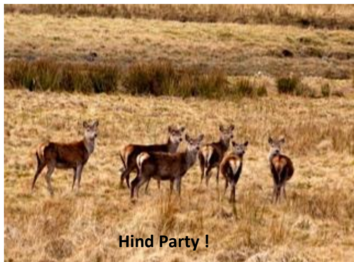
Hind Party !

This was Eagle country but unfortunately our Eagle count was also zero, a couple of Buzzards were doing their best on the way back, but two Sparrowhawks and the aforementioned Kites were all the raptors we spotted in the three glens. What goes up usually comes down but with not a lot of up it was a longer way down, oxymoronicly, and back to the comfort and delights of the Achness hotel. The Saturday night ceilidh has an interesting format. The aforementioned highly talented are thrown together into pairs or threes, but sometimes slightly out of comfort zones by a simple raffle system. They perform between the dances and it certainly makes for a diverse and entertaining night!