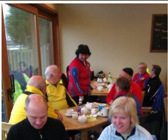
12 th Jan. Muddy Boots Farm