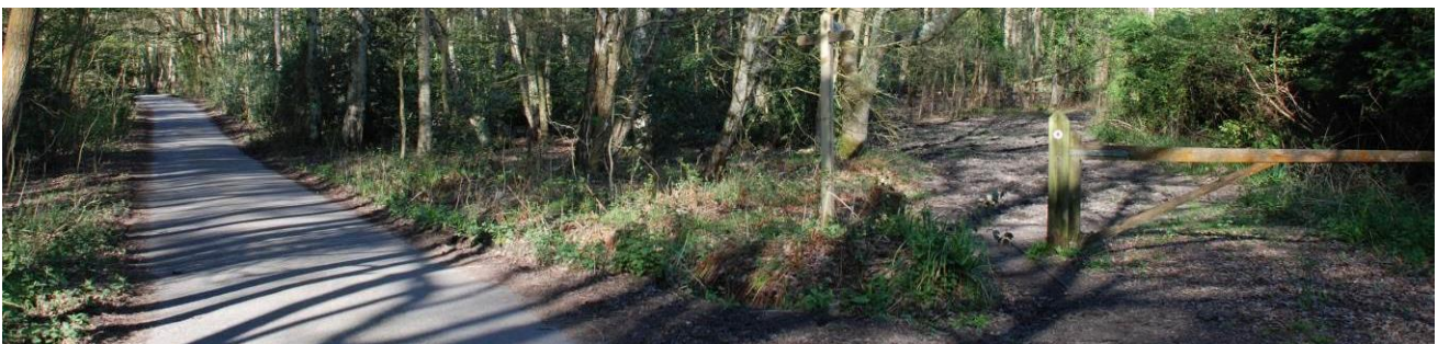
There is no legal right to cycle on the well-surfaced footpath on the left, but riding on the rutted, uneven bridleway on the right is perfectly legal.

By contrast, Scotland's Land Reform Act 2003 gave cyclists lawful access to most countryside in Scotland (see Cycling UK's briefing Offroad Access in Scotland ). Suitably adapted legislation that would have a similar effect in England and Wales is one way of enhancing the opportunities to cycle in the countryside. In the meantime, simplifying the existing (and time-consuming) legal procedures for converting footpaths into cycle tracks would help expand the rights of way available for cycling (see Cycling UK's Footpaths briefing).