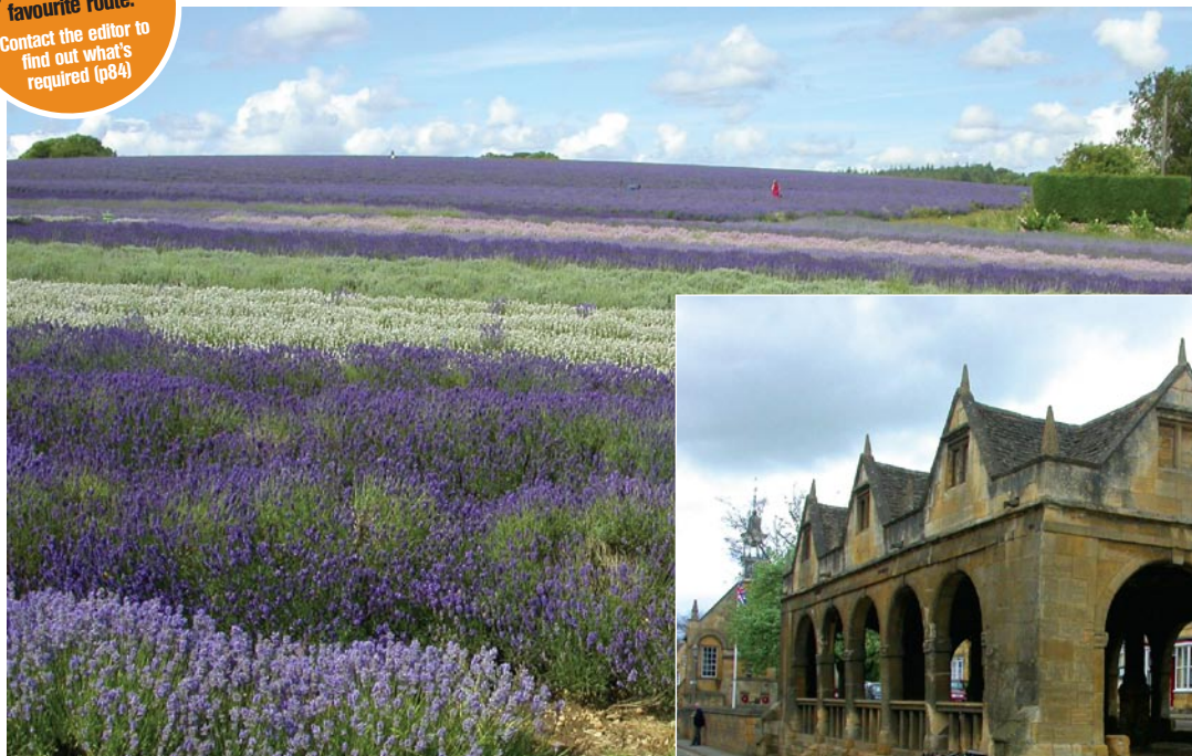
(Left) There's a café at the Lavender Farm (Below) Chipping Camden

We want to publish your local group's favourite route. Contact the editor to find out what's required (p84)