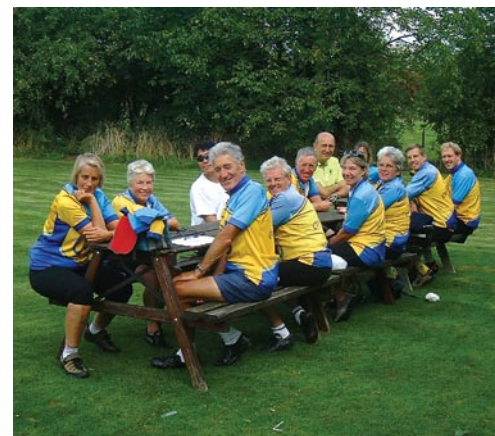
(Above) Lunch stop at Moreton-in-Marsh – home to the 2008 Birthday Rides

After Kineton, you climb until you're at about 1,000ft again. There are fine views over Winchcombe and Sudeley castle, before you descend towards Cheltenham. From Ham Hill, just past Whittington, there's a panoramic view. On a clear day you can see the Black Mountains in Wales.