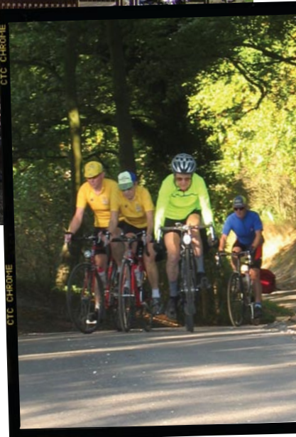
(Main) The Hatchett Inn is a good refreshment stop

On leaving Lower Chute the route climbs gently up to Chute Causeway, along the Causeway followed by an exhilarating descent of Conholt Hill. It then meanders through the Downs before ascending Walbury Hill