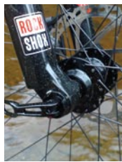
(Above and right) Fork and wheel will flex less in turns thanks to the oversize through-axle hub