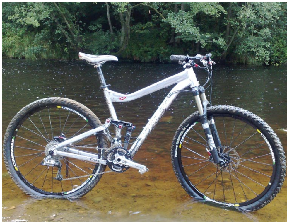
29ers have been big news in the United States for some time. But they're slowly gaining ground over here

The trail hardtail sector is busier than ever with potential options for 2010 and some might look better value than the 905 on paper. Hit the trail with conviction, though, and few – if any – manage to combine the diverse demands of an aggressive 'have a go' attitude with mile-eating speed quite as well as the Whyte.