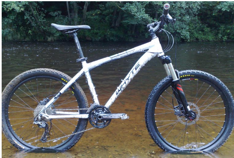
Trail hardtails like Whyte's 905 are gaining popularity among riders wanting to put the bite back into their riding