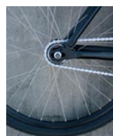
Eyelets for mudguards and a rear pannier rack are practical touches. The rear spacing is 120mm

The Vee-1 is strong, light, and manoeuvrable enough for proper mountain biking. For use off-road, I'd recommend a 32 or 34 instead of that 42. Just be aware that the frame is a bit tight in the chain-stays, so you can't cushion the rear end with a 2.3in tyre. Even a 2.2in tyre is doubtful. If it's a bargain off-road singlespeed you're after, consider the forthcoming 29er version instead (£279.99), as the bigger