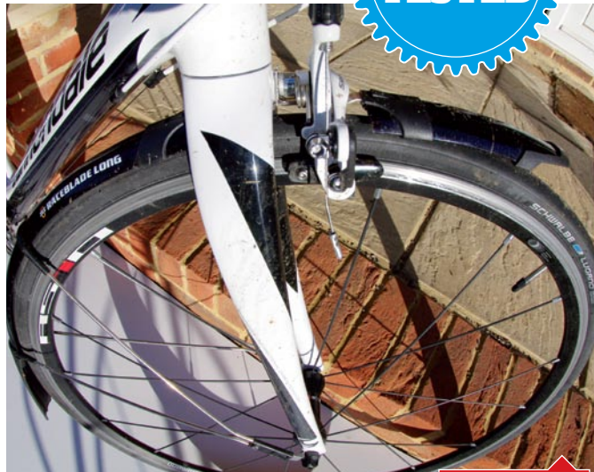
SKS RACEBLADE LONG