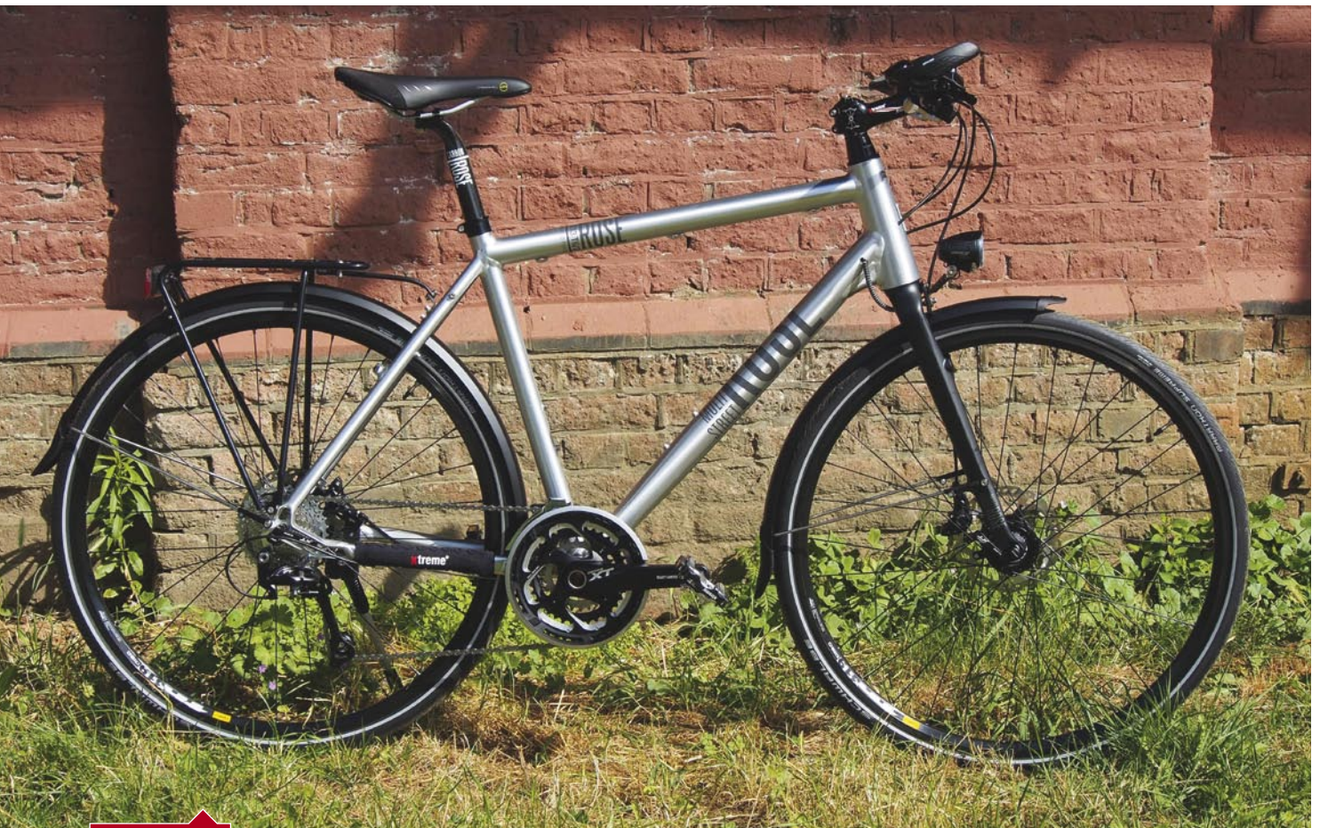
ROSE MULTISTREET 3