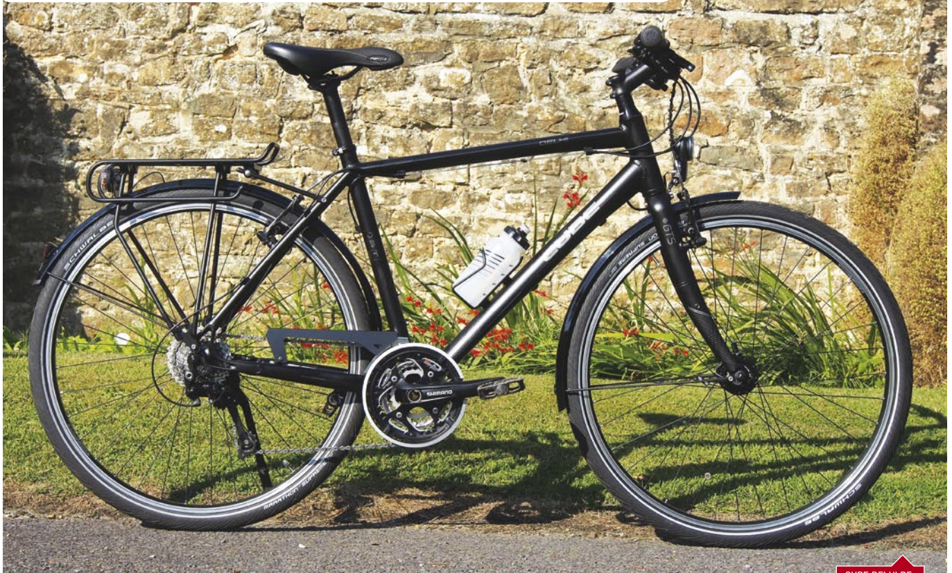
CUBE DELHI RF