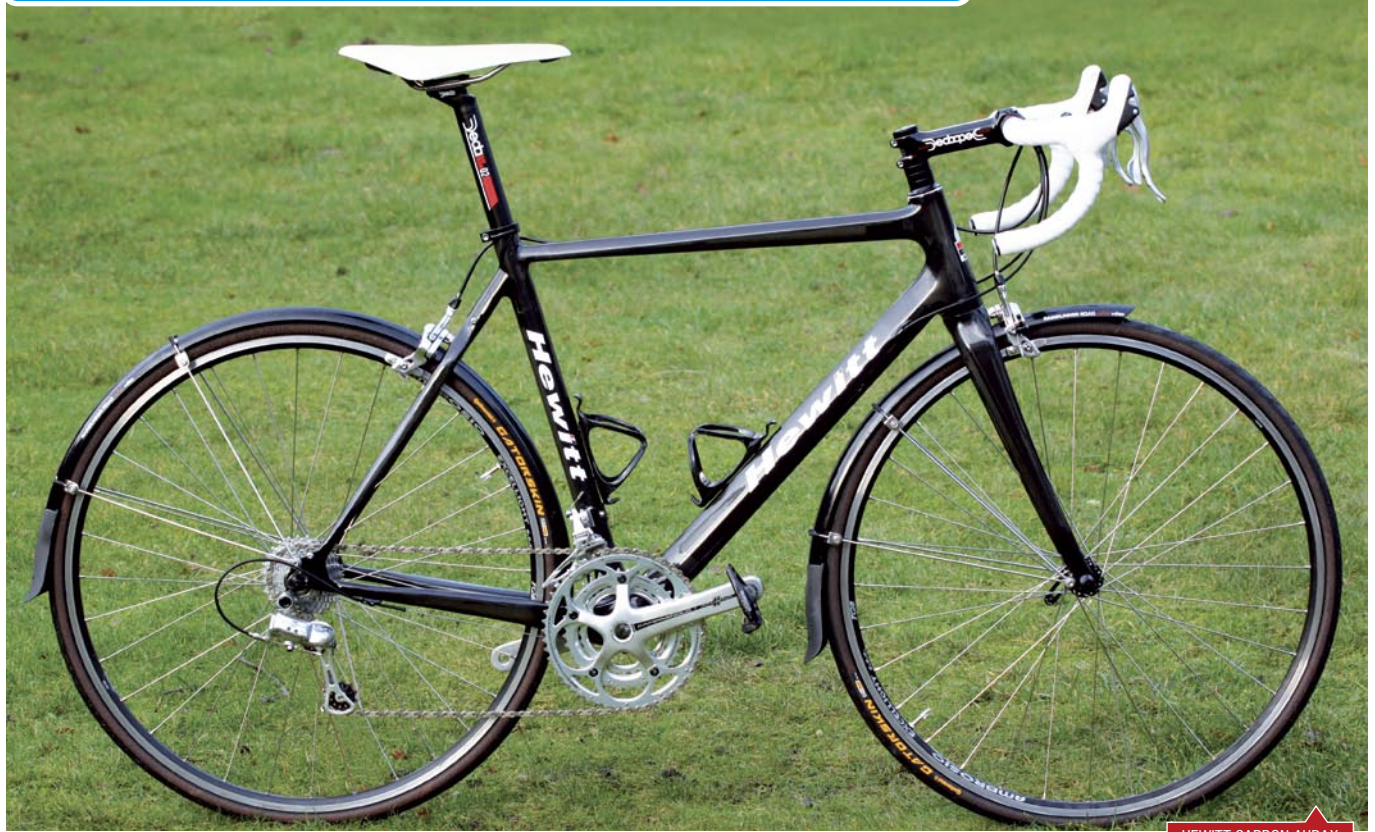
HEWITT CARBON AUDAX