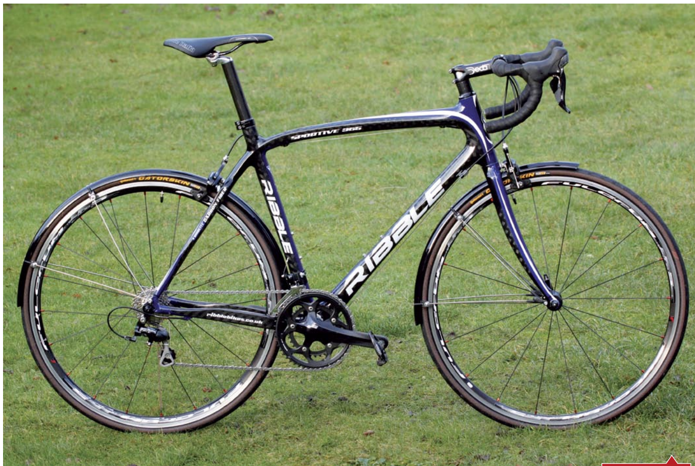
RIBBLE SPORTIVE 365

This is particularly valuable on bikes like these; by manipulating the tubes, it's possible to have plenty of tyre clearance without hugely long chain-stays or cutting into heel clearance.