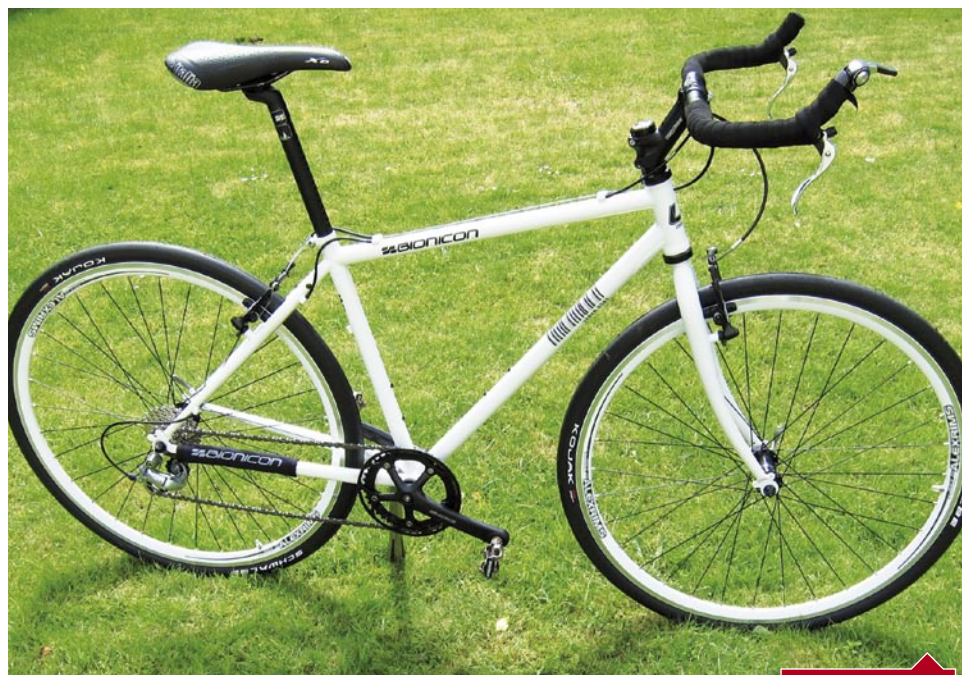
BIONICON URBAN ROAD