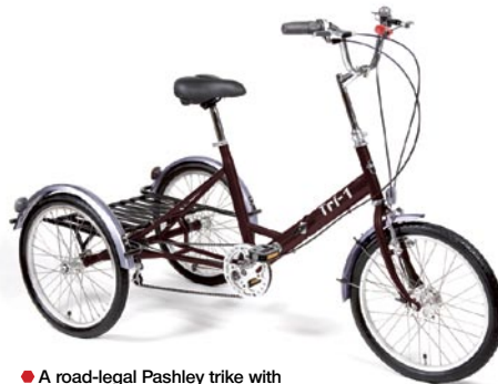
● A road-legal Pashley trike with its two brakes on the front wheel

Contact the experts Email your technical, health, legal or policy questions to editor@ctc.org.uk or write to CTC Q&A, PO Box 313, Scarborough, YO12 6WZ . We regret that Cycle magazine cannot answer unpublished queries. But don't forget that CTC operates a free-to-members advice line for personal injury claims, tel: 0844 736 8452 .