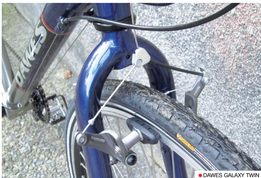
● DAWES GALAXY TWIN

● (Above) Although there are mudguard fittings, our front guard wouldn't fit at the fork crown so had to be left off. The supplied front rack isn't shown either. (Right) A simple suspension seatpost helps cushion the stoker from bumps and potholes the pilot fails to avoid. The Orbit also has one.