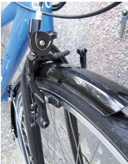
● (Above) A Travel Agent enables the Orbit's right-hand Sora STI lever to operate a front V-brake. The rear V-brake is a drag brake operated by a bar-end friction lever, while the left-hand Sora lever works an Avid BB7 rear disc.

Direct lateral designs differ on details such as the precise positioning of the rear lateral tube. The Orbit closely approximates to a classic example, its only obvious departure from a strict interpretation being the alignment of the rear top tube, which joins the seat tube below the seat stays. The bottom tube, also known as the 'link' or 'boom' tube, connects the two bottom bracket shells and must be super-stiff for transmission efficiency. Orbit's design