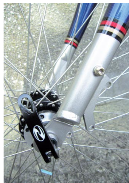
● (Above) The Dawes fork and hub are disc-brake ready. That means a little extra weight if you're happy with the front cantilever. The fork has less offset than the Orbit's. Trail figures are similar since the Dawes uses a steeper head angle, but the Orbit's handling is more assured.

Both tandems combine a neatly TIG-welded aluminium frame, built using greatly-oversized tubes, with a TIG-welded unicrown steel fork. It's a well-chosen combination for tandem use, where the fork needs to be exceptionally strong yet resilient and the frame torsionally stiff. Both use a version of the direct lateral tandem frame layout, which is widely considered the best way to build a road tandem. The long central tube, split at the front seat tube and running from the head tube to a point close to the rear bottom bracket shell, adds lengthways torsional stiffness and constructs a triangle within the main frame for vertical strength, both with the minimum of material.