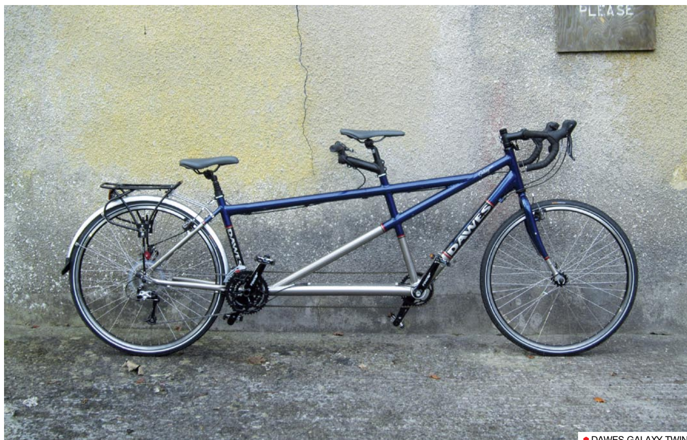
● DAWES GALAXY TWIN