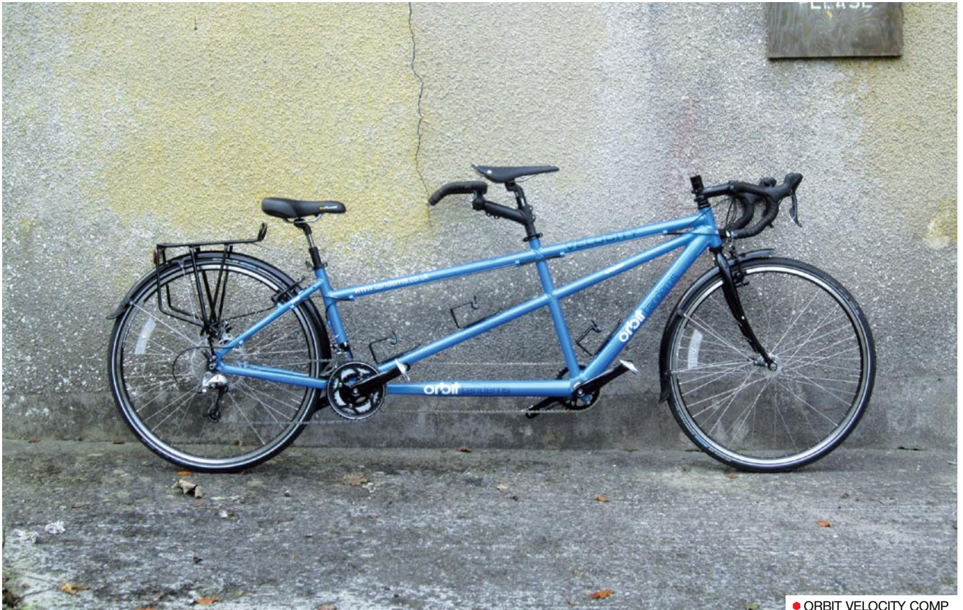
● ORBIT VELOCITY COMP