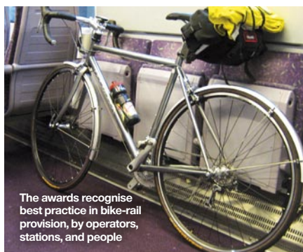
The awards recognise best practice in bike-rail provision, by operators, stations, and people