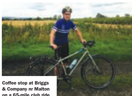
Coffee stop at Briggs & Company nr Malton on a 65-mile club ride

I went out with the fast group on a 65-mile Sunday ride into the Wolds and back through the Vale of Pickering. The pace was brisk – an average moving speed of 17.8mph – but not chain-gang fast. The Longitude's weight was again evident on long climbs, and the 90in