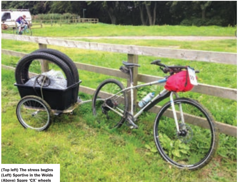
(Top left) The stress begins (Left) Sportive in the Wolds (Above) Spare 'CX' wheels