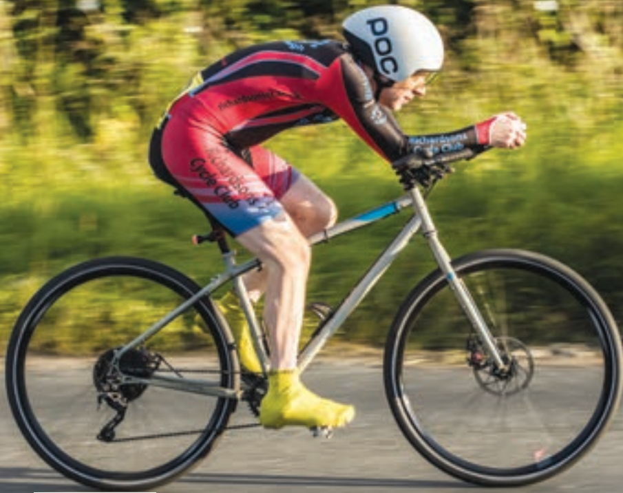
No one's idea of a sensible TT bike. My 10 time was 26:05