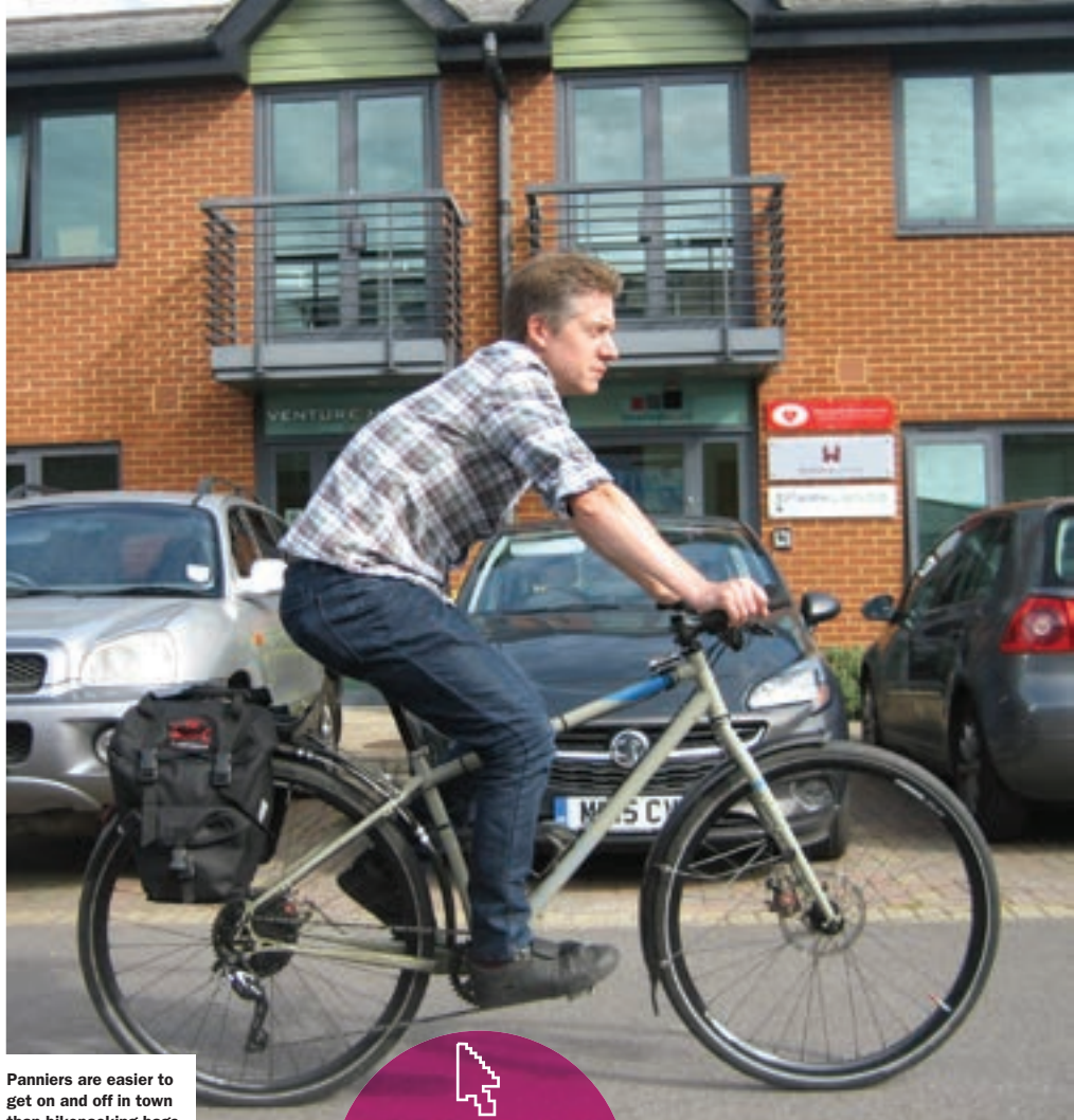
Panniers are easier to get on and off in town than bikepacking bags

I was worried about casual theft of the front wheel when I left it in town for a few hours, so took an extra lock. The rear wheel was tricky to remove with the rack-and-mudguard in place due to the Longitude's rear facing dropouts – a blessing for security, but potentially awkward for punctures. I didn't get any: Marathon Supremes are robust and