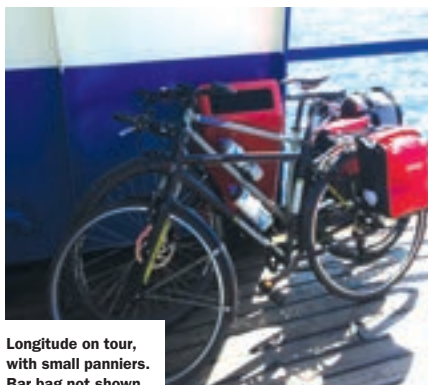
Longitude on tour, with small panniers. Bar bag not shown

It wouldn't be everyone's choice, but the Longitude already is my touring bike. I'm happy with a flat bar, as long as it has bar ends, and like having tyres (normally Schwalbe Big Apples) wide enough to tackle any reasonable track. The tough steel frame, unlike a certain Prime Minister, really is strong and stable, and the long chainstays mean that big rear panniers fit fine. I tended to use small ones, so a bottom gear of 24in wasn't a problem. Nor was the lack of a high