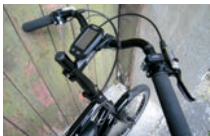
Above: Charge remaining is displayed on the highly informative STEPS console on the handlebar

The basic Helios design employs small wheels, a one-size frame, very long seatposts, and plenty of handlebar position adjustment, so