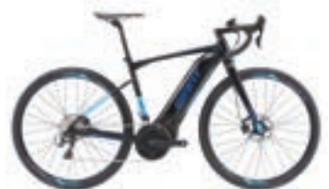
Old Road E+1 models lacked bottle bosses

The latest Road E+1 version has bottle cage mounts on the seat tube. On your bike, you could fit band-on cage mounts there, e.g. the SKS Anywhere Bottle Cage Adapter. For the stem cap mount, you want the KlickFix Bottlefix Ahead Adaptor – try Practical Cycles: bit.ly/cycle-bottlefix .