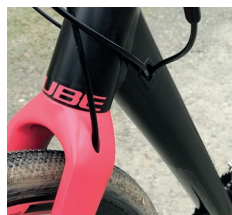
Above: The cables are routed internally, making for a clean and tidy look. Easier to hose down too!

There are frame fittings for mudguards and a rack on the Nuroad WS; Cube's in-house accessories will of course fit if