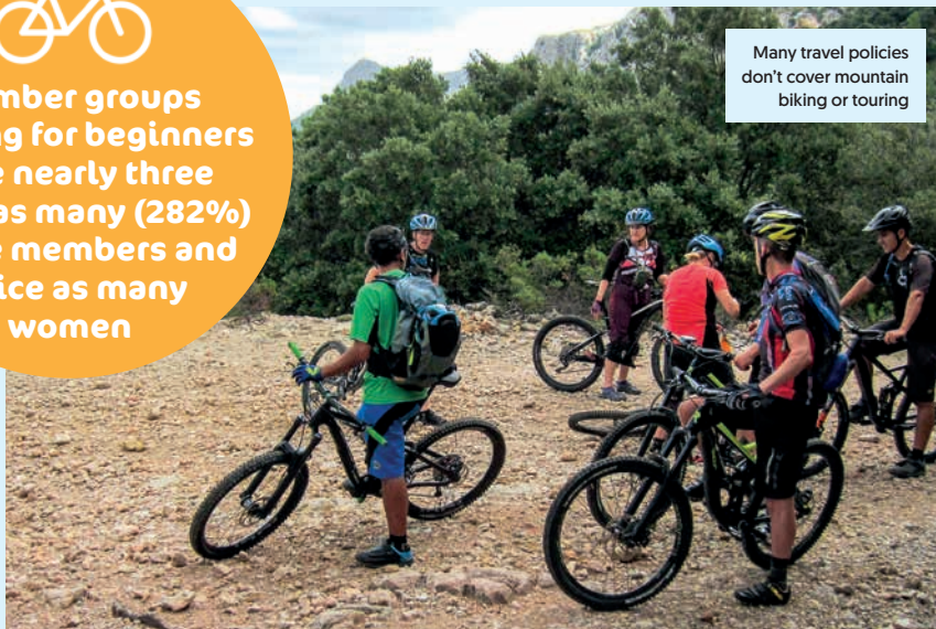
Many travel policies don't cover mountain biking or touring

Member groups catering for beginners have nearly three times as many (282%) active members and twice as many women