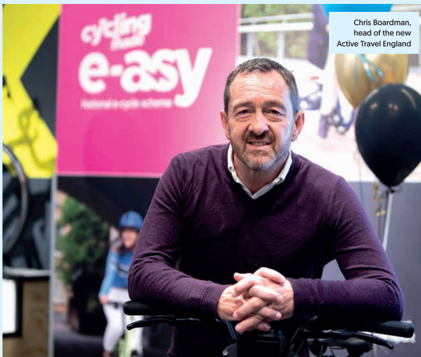
Chris Boardman, head of the new Active Travel England

The Caravan and Motorhome Club is offering you 8% off glamping breaks via Experience Freedom. They're the perfect base to get out and explore new areas, tracks, and trails, with luxury camping options in some of the most picturesque spots in the UK. You can also get 10% off bike servicing at Halfords to keep your bike in top condition for your summer getaway. More at: cyclinguk.org/member-benefits