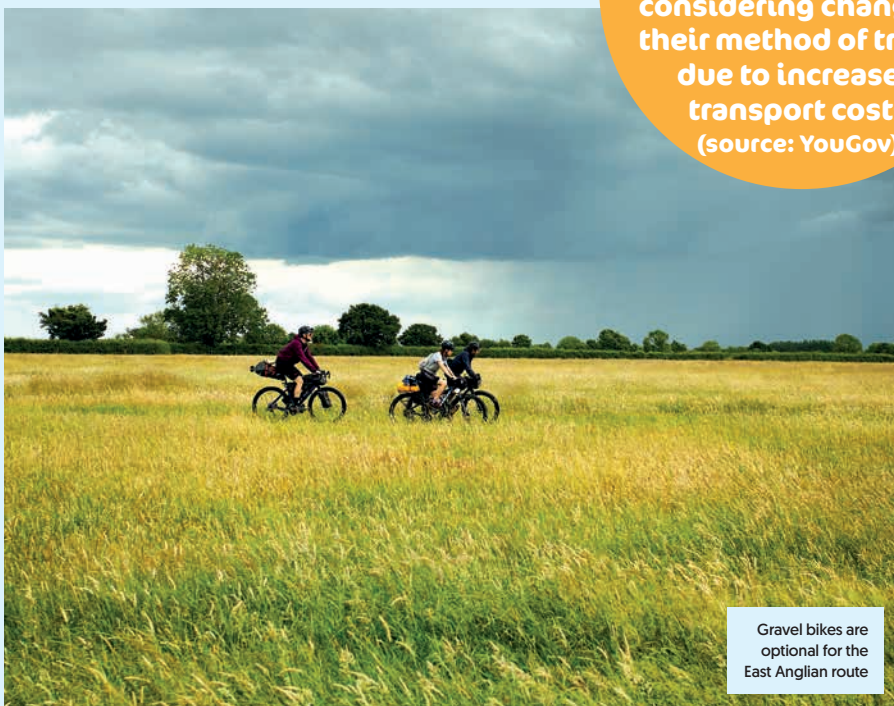
Right: Jordan Gibbons

of 18-24-year-olds are considering changing their method of travel due to increased transport costs (source: YouGov)