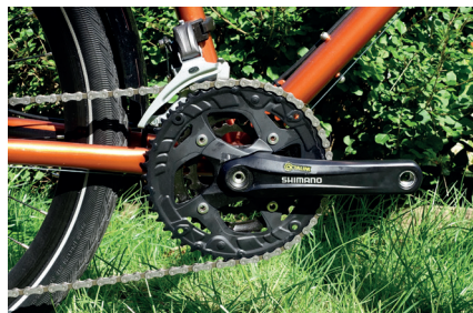
Above: A 48-36-26 triple chainset drives an 11-36 cassette, giving a low bottom gear and nicely spread ratios

Those 26in wheels might seem retro but you'll be able to buy replacement tyres all over the world, and Schwalbe's Marathons are tough and have effective reflective strips. Triple chainsets are also rarely seen today but yes, they exist, and the Ridgeback's 26-tooth inner ring pairs well with the cassette's 36t big sprocket for a