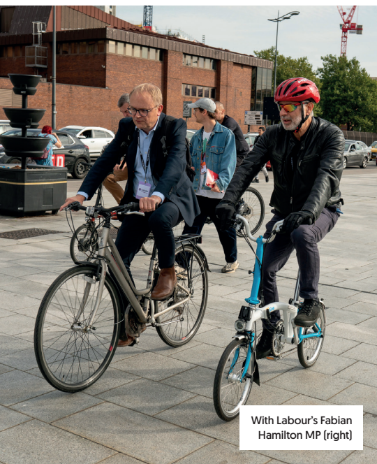
With Labour's Fabian Hamilton MP (right)

“LONG-TERM INVESTMENT AND BUILDING MORE CYCLE LANES GETS MORE PEOPLE CYCLING. WE’VE SEEN THIS IN LONDON. CYCLING LEVELS CONTINUE TO INCREASE YEAR BY YEAR IN THE CAPITAL”