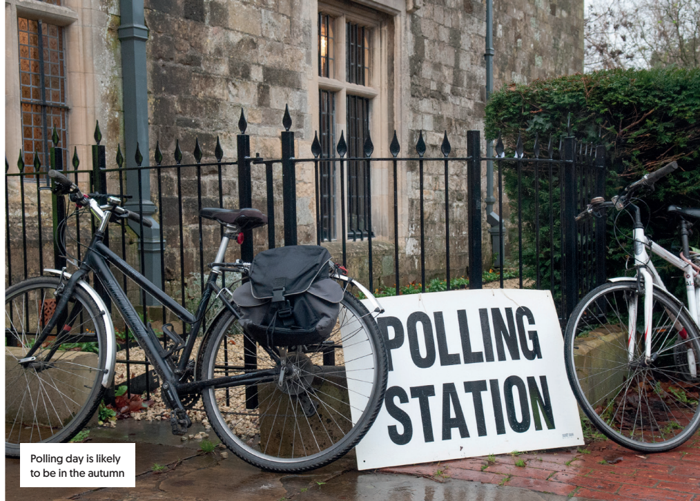
Polling day is likely to be in the autumn

“LONG-TERM INVESTMENT AND BUILDING MORE CYCLE LANES GETS MORE PEOPLE CYCLING. WE’VE SEEN THIS IN LONDON. CYCLING LEVELS CONTINUE TO INCREASE YEAR BY YEAR IN THE CAPITAL”